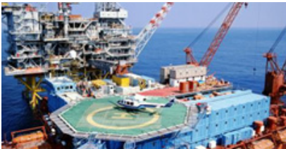
Offshore & Marine

Petroconsult Engineering Has Four Technical Divisions, Each Of Which Is Fully Geared To Transform It's Specific Field's Rising Challenges, Into Our Famous Petroconsult Professional Solutions.