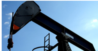
Oil, Gas & LNG